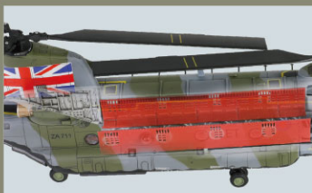
Fully detailed interiors