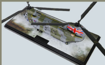
Display base graphic base on real Scenes