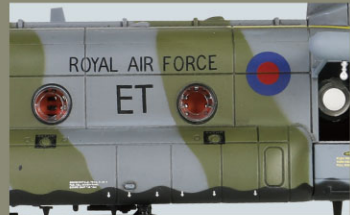
Research base on real helicopter