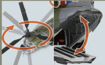
Movable spinning blades and rear access ramp