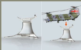
Sturdy display stand