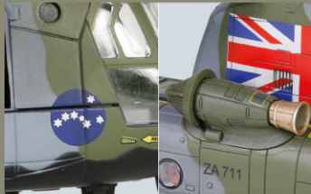
Intricate surface details and FOV signature weathering