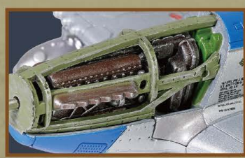
Intricately detailed engine.