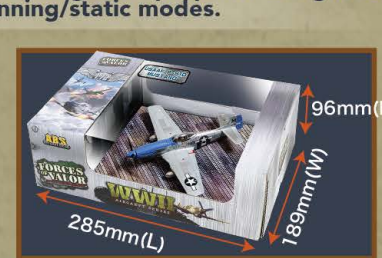
Exquisite and standard size FOV aircraft series packaging.