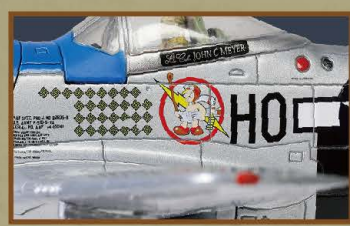
Highly detailed pad print.