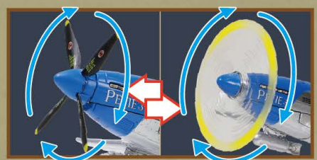
Interchangeable propeller designs for spinning/static modes.