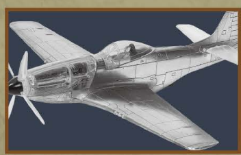
95% diecast body structure.