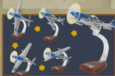
Authentic display stand with clockwise/counter-clockwise tilt.