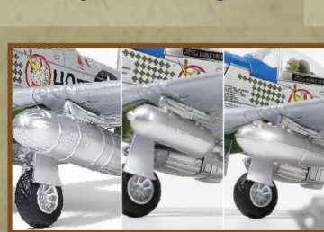
Decorative removable drop tanks.