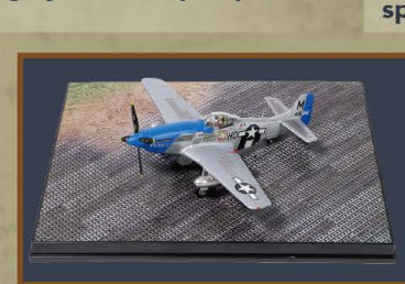
Full coloured ground parking display base.